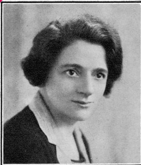
MISS ELLEN WILKINSON travailleuse

Ellen Wilkinson (1891-1947) was a Labour Party politician and MP for Middlesbrough East (1924-1931) and Jarrow (1935-1947). She spoke passionately in favour of women's interests, including equal pay. Ellen became only the second woman to obtain a position in the Cabinet and was responsible for increasing the school leaving age to 15. She also participated in the 'Jarrow Crusade', where 200 unemployed men marched from Jarrow in northeast England to London, protesting against unemployment and poverty.